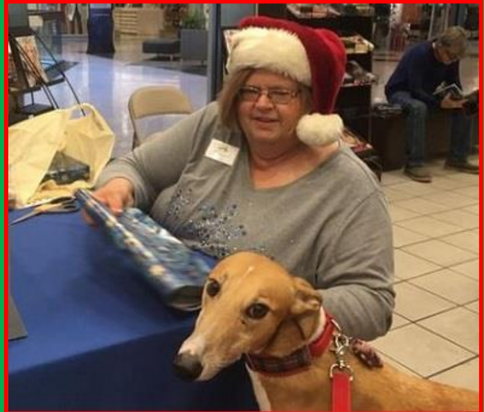
Champ, the gift wrapping assistant!!