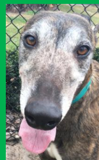
LK's Power Up