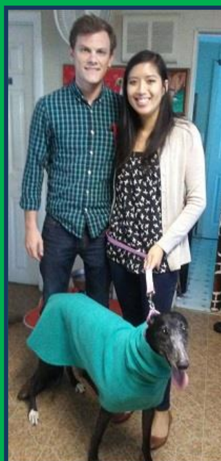
Sunday in her new coat with her new Mom and Dad!