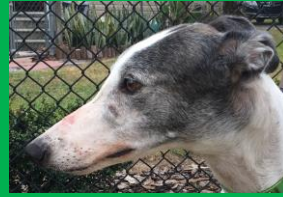
AMF Buyer's Beware